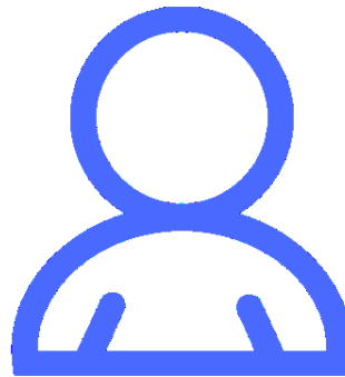
Chief Behavioral Economist